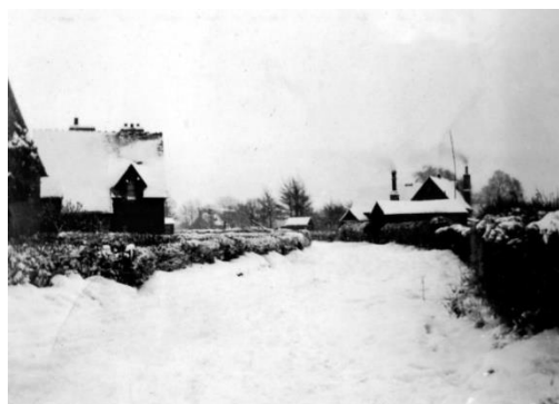
New Road with the fire on in The School