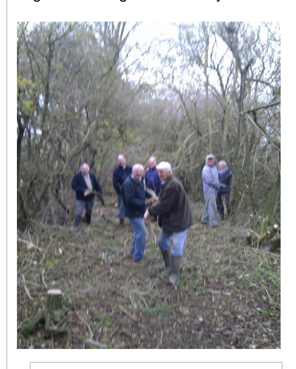
Charney Army at work

The <u>Charney Army</u> with the help of David Godfrey has now completed the first stage of the plan by clearing vegetation along the causeway in four working sessions amounting to some 70-80 hours of work.