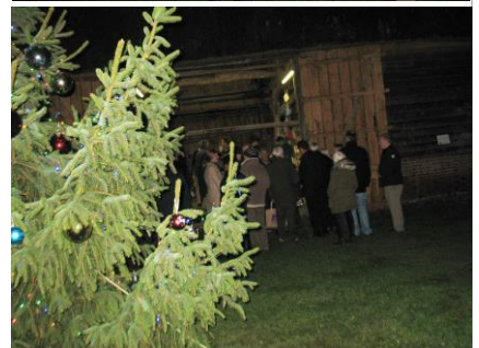
On the Green 16 th December