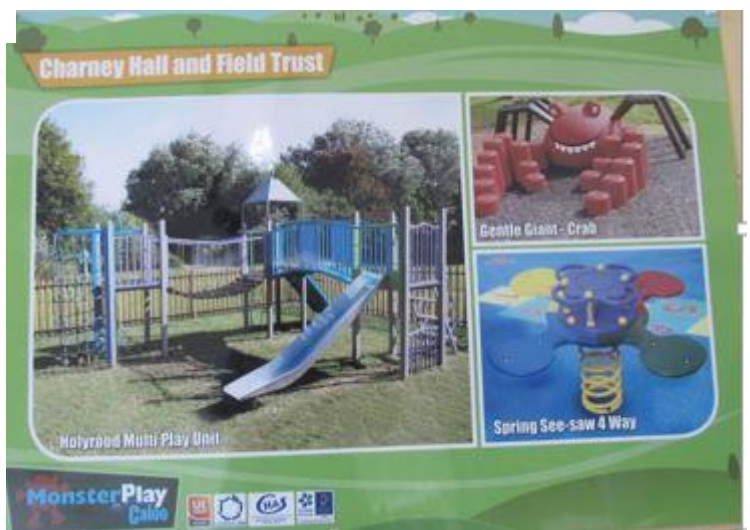
Plans for the new children's playground