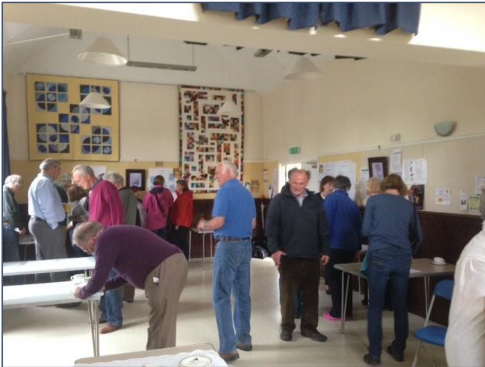
Intense activity at the 'idea stations'

On Saturday 13 th June the Community Plan Steering Group hosted an open afternoon for the village to assess the ideas generated so far for the Plan. About 30 people participated in the session where the ideas were discussed, individuals volunteered to progress them and new ideas were generated.